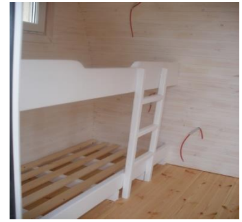
Option of built in bunks & beds