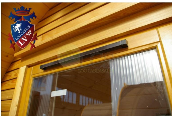
Trickle Vents in Windows