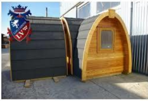
One or two metre covered canopy