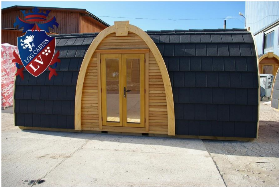
4m, 5m or this 6 metre cabin