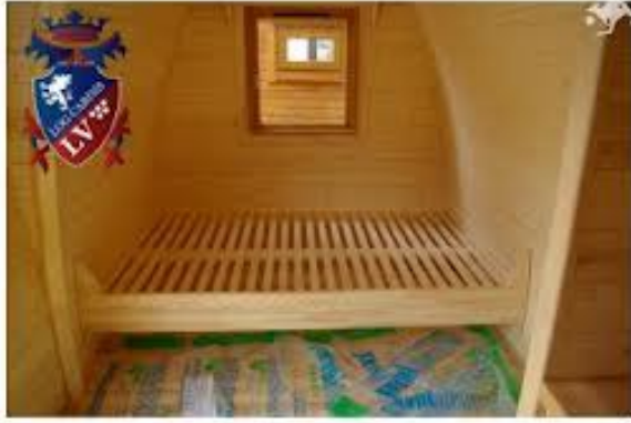
Built in double bed